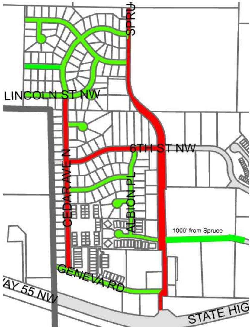
Project Area Location Map (red and green areas below)

Safety- On any project our first concern is always safety. Please be reminded the size and weight of the machinery, and the noise and dust produced makes it difficult for workers to keep track of the whereabouts of onlookers, especially children. You can help us minimize the potential for accidents by keeping neighborhood children clear of the construction area and equipment at all times.